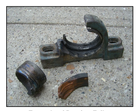
Example of Bearing Failure