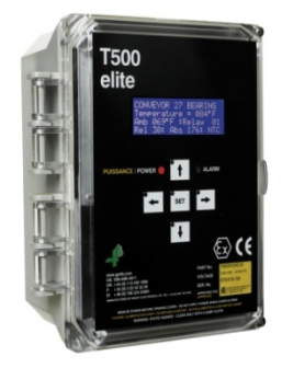
T500 Hotbus Elite