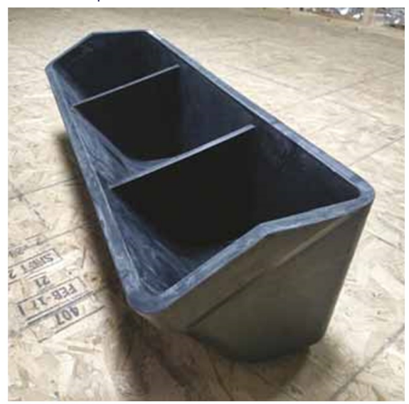
1000 \times 325 \times 300 \text{ mm NYRIM}^{\circ} chain elevator bucket, weighing 18 kg.

elevators can achieve capacities and lift heights never before possible, thanks primarily to advancements in elevator belting technology.