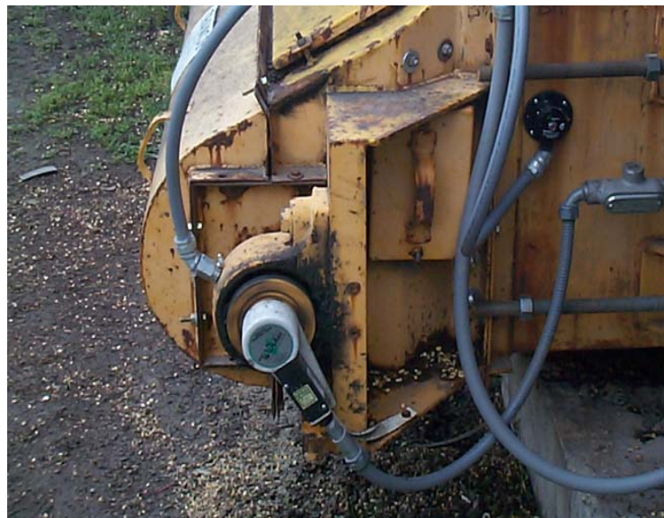
Whirligig installed on an enclosed belt conveyor shown with M800 speedswitch

Please refer to instruction manual for correct installation. Information subject to change or correction. February 2006.