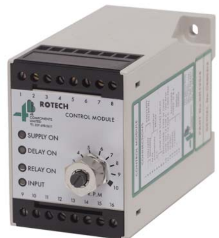
Speed Relay (Optional)

Please refer to instruction manual for correct installation. Information subject to change or correction. July 2007.