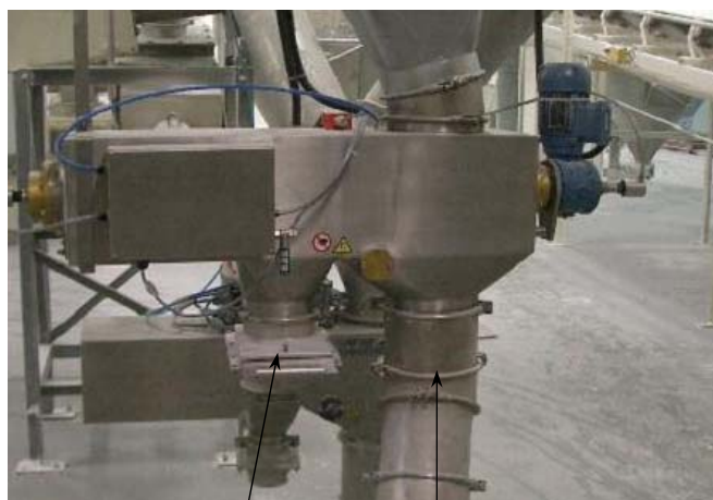
Reject chamber outlet Product outlet